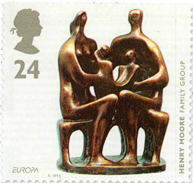
The 1993 stamp featuring the new Europa logo

Nearing the end of our Europa journey, in 2007 the series celebrated the centenary of Scouting; Royal Mail incorporated the Europa logo on the first-class and 48p stamps. For the Letters theme in 2008, our first-class stamp showed a Labrador carrying a letter in his mouth. Last year's issue covered Astronomy. One of the Eminent Britons stamps portrayed Sir Martin Ryle, Astronomer Royal 1972-82, to which the Europa sign was added at top right. Which brings us to the present day and 2010's theme of Children's Books. Look out for the Europa logo included in the October issue, featuring the much-loved Winnie-the-Pooh ●